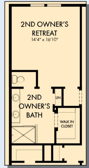
OPTIONAL 2ND OWNER'S RETREAT WITH 2ND OWNER'S BATH AT BEDROOMS 4 AND 5

For additional options, please visit DavidWeekleyHomes.com