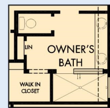
OPTIONAL WALK IN SHOWER AT OWNER'S BATH