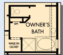
OPTIONAL DROP IN TUB WITH SEPARATE SHOWER AT OWNER'S BATH