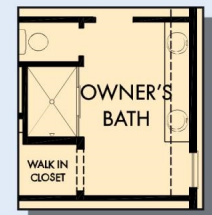
OPTIONAL SHOWER AT OWNER'S BATH