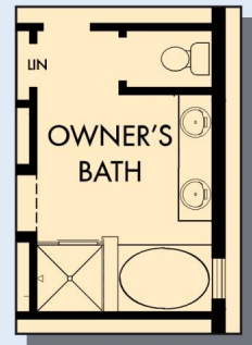
OPTIONAL SLIDE-IN TUB WITH SEPARATE SHOWER AT OWNER'S BATH