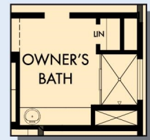
OPTIONAL SHOWER AT OWNER'S BATH