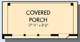
OPTIONAL COVERED PORCH

2,234 - 2,290 sq. ft. • 4 Bedrooms • 3 Full Baths • 2 Car Garage