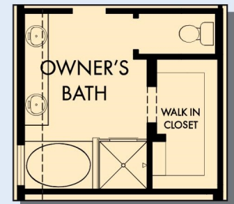
OPTIONAL SLIDE IN TUB WITH SEPARATE SHOWER AT OWNER'S BATH