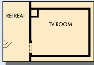
OPTIONAL TV ROOM