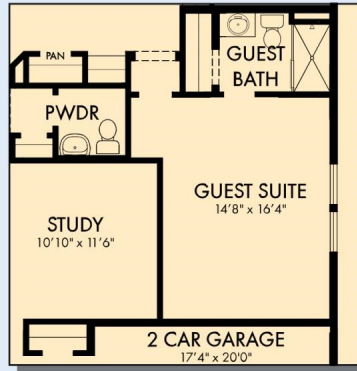
OPTIONAL GUEST SUITE WITH POWDER BATH AT BEDROOM 2 AND 3