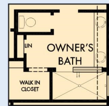
OPTIONAL WALK IN SHOWER AT OWNER'S BATH