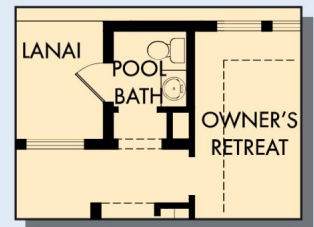
OPTIONAL POOL BATH AT LANAI