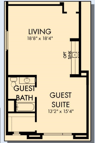
OPTIONAL GUEST SUITE AT BEDROOM 3 AND 4