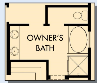
OPTIONAL SLIDE-IN TUB WITH SEPARATE SHOWER AT OWNER'S BATH