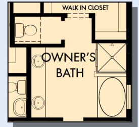
OPTIONAL SEPARATE TUB AND SHOWER AT OWNER'S BATH