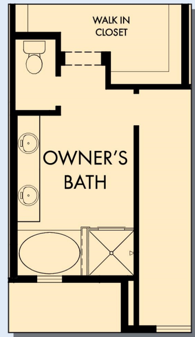
OPTIONAL SLIDE-IN TUB WITH SHOWER AT OWNER'S BATH

For additional options, please visit DavidWeekleyHomes.com