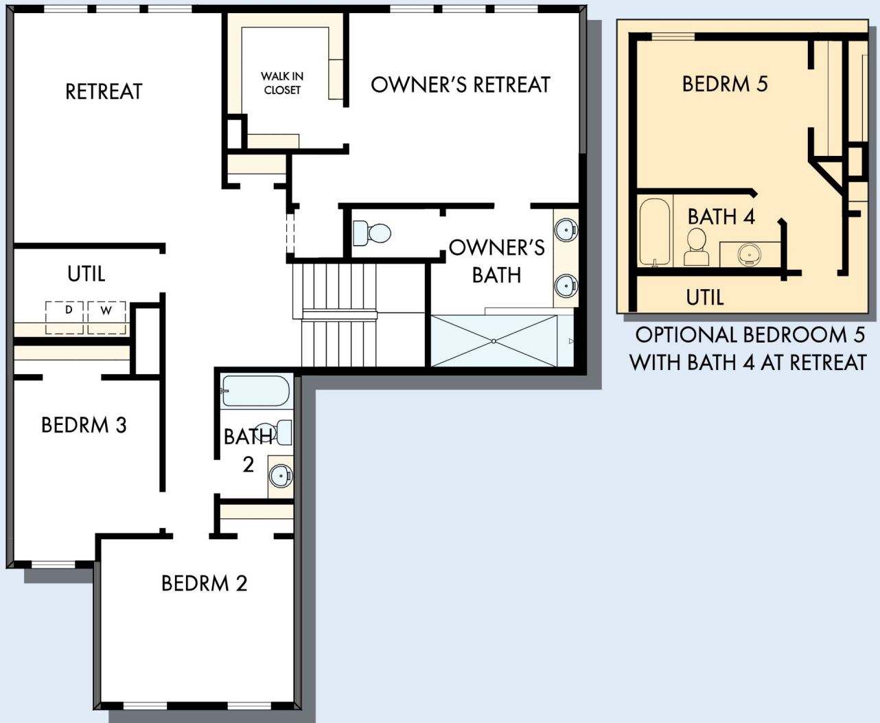
OPTIONAL BEDROOM 5 WITH BATH 4 AT RETREAT