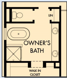
OPTIONAL FREESTANDING TUB WITH SEPARATE SHOWER AT OWNER'S BATH