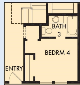
OPTIONAL BEDROOM 4 WITH BATH 3 AT DINING