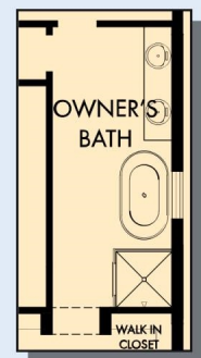
OPTIONAL FREE STANDING TUB WITH SEPARATE SHOWER AT OWNER'S BATH