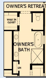
OPTIONAL FREE-STANDING TUB WITH SEPARATE SHOWER AT OWNER'S BATH