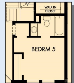
OPTIONAL BEDROOM 5 WITH BATH 3 AT DINING