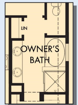
OPTIONAL SLIDE-IN TUB WITH SEPARATE SHOWER AT OWNER'S BATH