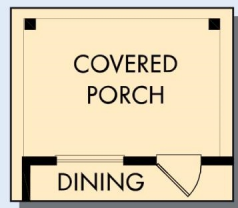
OPTIONAL COVERED PORCH AT DINING

2,676 - 2,744 sq. ft. • 4 Bedrooms • 2 - 3 Full Baths • 1 Half Bath • 3 Car Garage