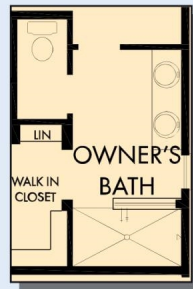
OPTIONAL WALK-IN SHOWER AT OWNER'S BATH