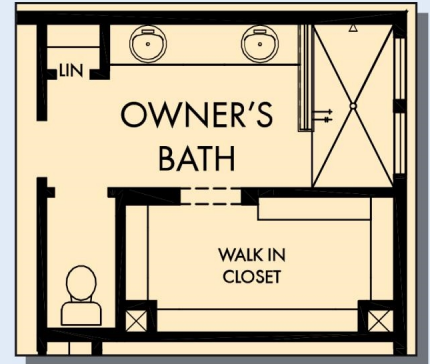
OPTIONAL WALK-IN SHOWER AT OWNER'S BATH