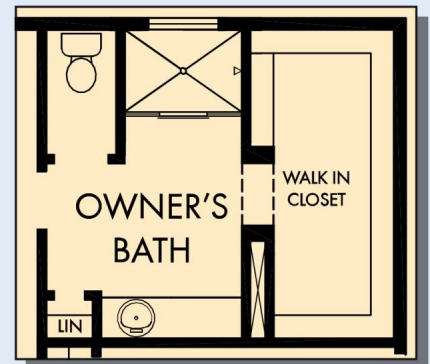
OPTIONAL SHOWER AT OWNER'S BATH