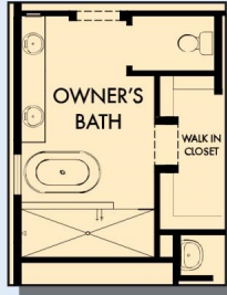
OPTIONAL FREE STANDING TUB AT OWNER'S BATH

2,853 - 2,855 sq. ft. • 3 Bedrooms • 3 Full Baths • 1 Half Bath • 3 Car Garage