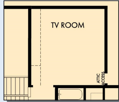
OPTIONAL TV ROOM