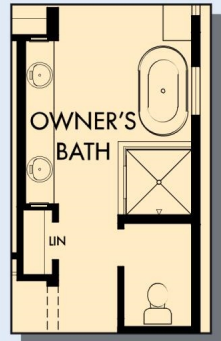
OPTIONAL FREE STANDING TUB WITH SEPARATE SHOWER AT OWNER'S BATH