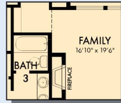
OPTIONAL WALL FIREPLACE AT FAMILY