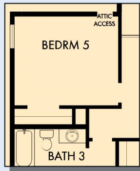
OPTIONAL BEDROOM 5 AT RETREAT