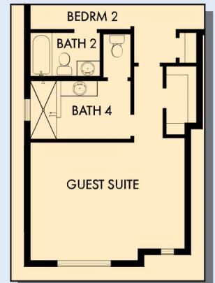
OPTIONAL GUEST SUITE WITH BATH 4 AT BEDROOM 3 AND RETREAT