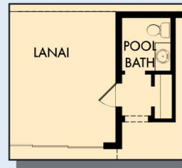
OPTIONAL POOL BATH

3,327 sq. ft. • 4 Bedrooms • 3 - 4 Full Baths • 1 Half Bath • 3 Car Garage