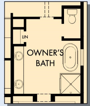
OPTIONAL FREE-STANDING TUB WITH SEPARATE SHOWER AT OWNER'S BATH

For additional options, please visit DavidWeekleyHomes.com