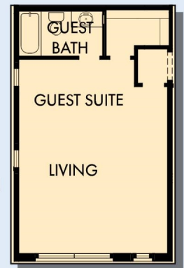
OPTIONAL GUEST SUITE WITH GUEST BATH AT BEDROOM 3 AND 4