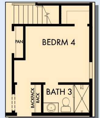
OPTIONAL BEDROOM 4 WITH BATH 3 AT STUDY