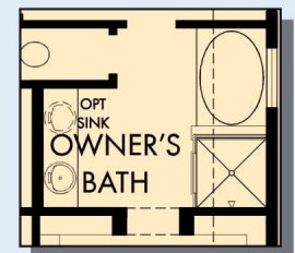
OPTIONAL SLIP IN TUB WITH SEPARATE SHOWER AT OWNER'S BATH