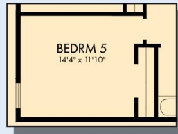
OPTIONAL BEDROOM 5 AT HOBBY