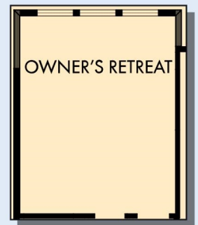
OPTIONAL EXTENDED OWNER'S RETREAT