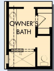
OPTIONAL WALK-IN SHOWER AT OWNER'S BATH