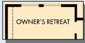
OPTIONAL EXTENDED OWNER'S RETREAT

1,853 - 1,922 sq. ft. • 3 Bedrooms • 2 Full Baths • 2 Car Garage