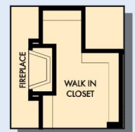
OPTIONAL WALL FIREPLACE AT FAMILY