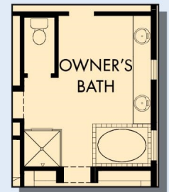
OPTIONAL DROP-IN TUB WITH SEPARATE SHOWER AT OWNER'S BATH