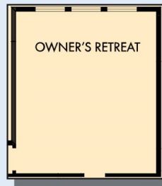
OPTIONAL EXTENDED OWNER'S RETREAT

2,975 - 3,073 sq. ft. • 4 Bedrooms • 3 Full Baths • 2 - 3 Car Garage