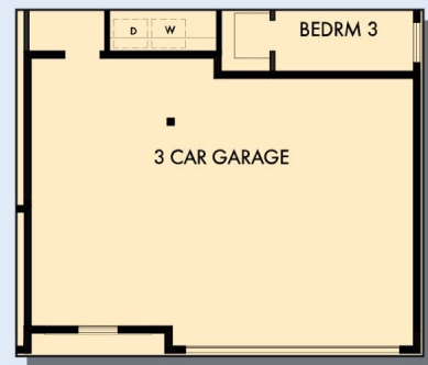
OPTIONAL 3 CAR GARAGE