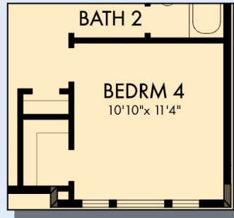
OPTIONAL BEDROOM 4 AT RETREAT