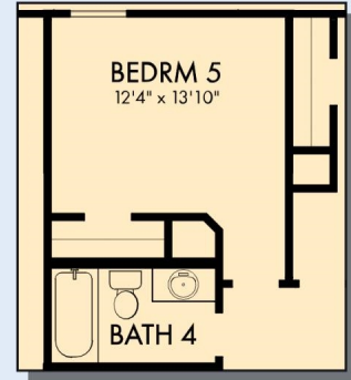
OPTIONAL BEDROOM 5 WITH BATH 4 AT RETREAT