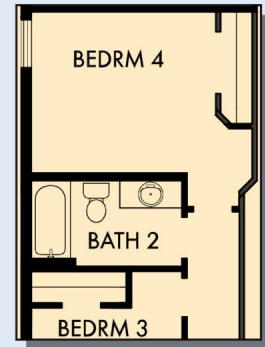
OPTIONAL BEDROOM 4 AT STUDY