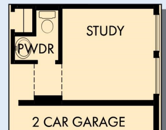
OPTIONAL POWDER BATH AT STUDY