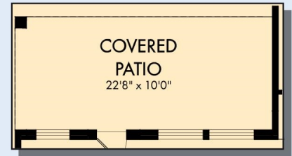
OPTIONAL EXTENDED COVERED PATIO