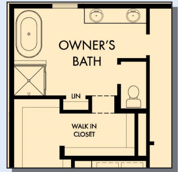
OPTIONAL FREE STANDING TUB WITH SEPARATE SHOWER AT OWNER'S BATH