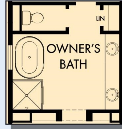
OPTIONAL FREE-STANDING TUB WITH SEPARATE SHOWER AT OWNER'S BATH