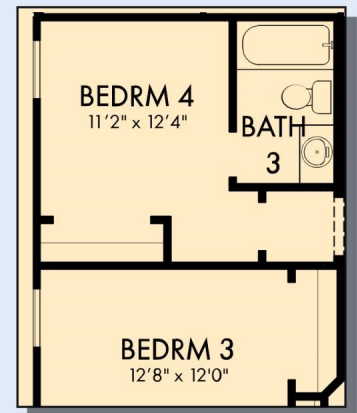
OPTIONAL BEDROOM 4 BATH 3 AT STUDY