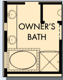
OPTIONAL DROP-IN TUB WITH SEPARATE SHOWER AT OWNER'S BATH