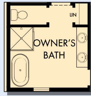
OPTIONAL FREE STANDING TUB WITH SEPARATE SHOWER AT OWNER'S BATH