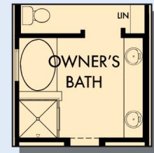
OPTIONAL SLIDE-IN TUB WITH SEPARATE SHOWER AT OWNER'S BATH