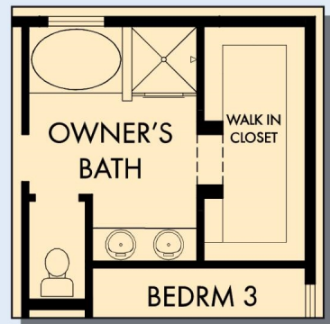
OPTIONAL SLIDE IN TUB WITH SEPARATE SHOWER AT OWNER'S BATH